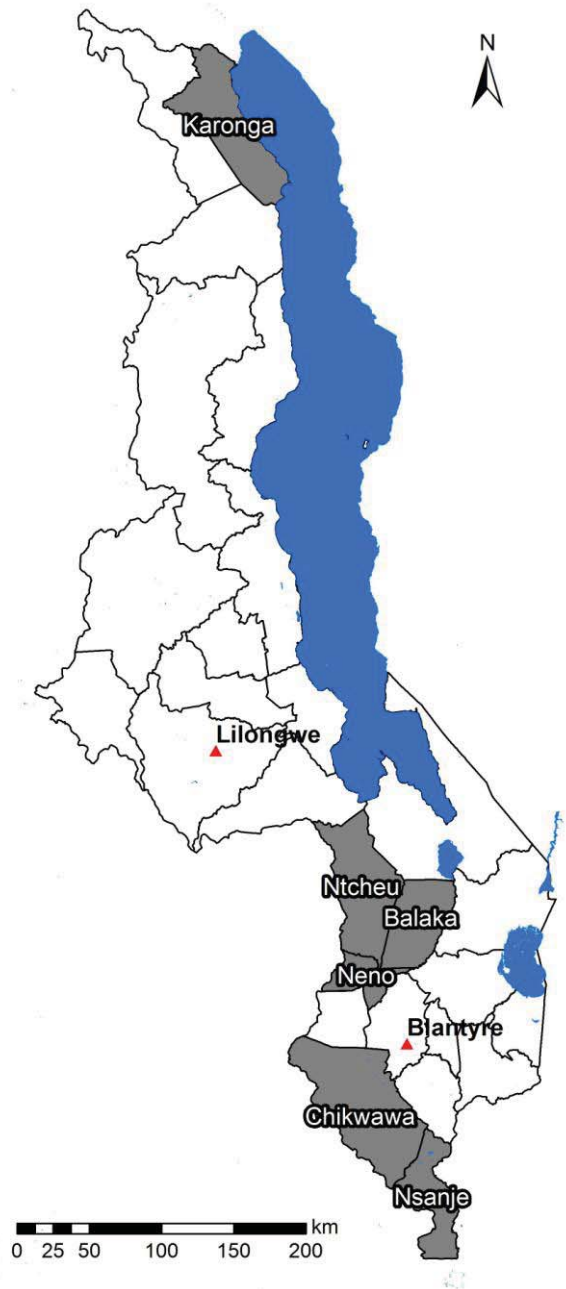
Figure 3: Districts wherein the demonstration trials are being conducted in 2009/10.